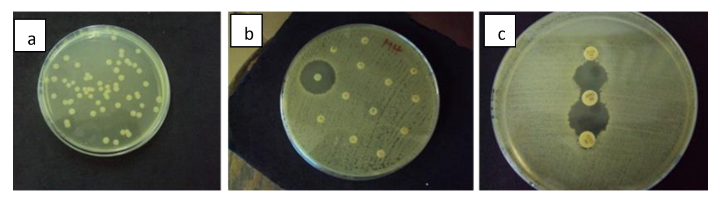
Figure 1. Detection of ESBL Escherichia coli producer on plate. a) Pure colonies of Escherichia coli . b) Antibiogram of Escherichia coli . c) Synergy test showing ESBL E. coli producer on Petri plate.

DNA template. Primers supplied by Promega according to each \beta -lactamase gene type are in Table 1. PCR was carried out under the following conditions on SensoQest Labcycler, GmbH, Germany: initial denaturation step at 96°C for 5 min, followed by 35 cycles consisting of denaturation at 96°C for 1 min, annealing at 58°C, 60°C and 50°C for TEM, SHV and CTX-M at 1 min, primer extension at 72°C for 1 min and final extension for 10 min.