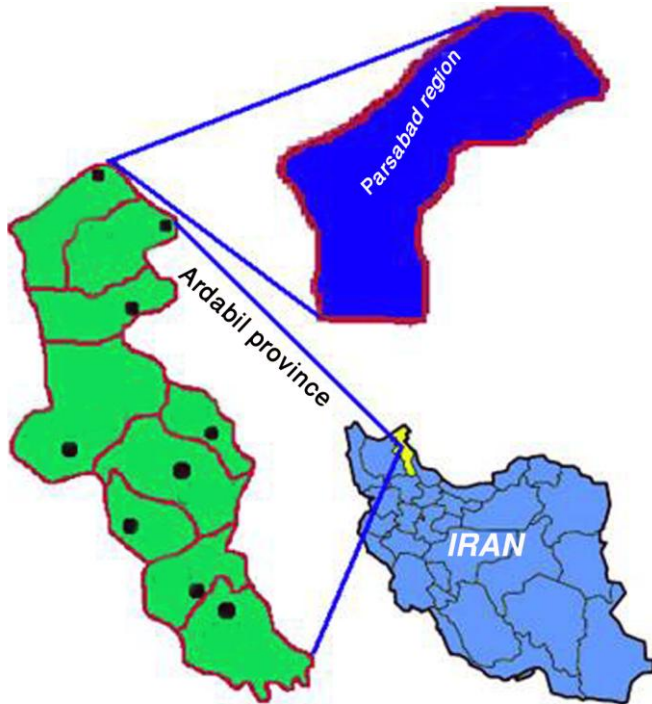
Figure 1. Parsabad location in Iran.