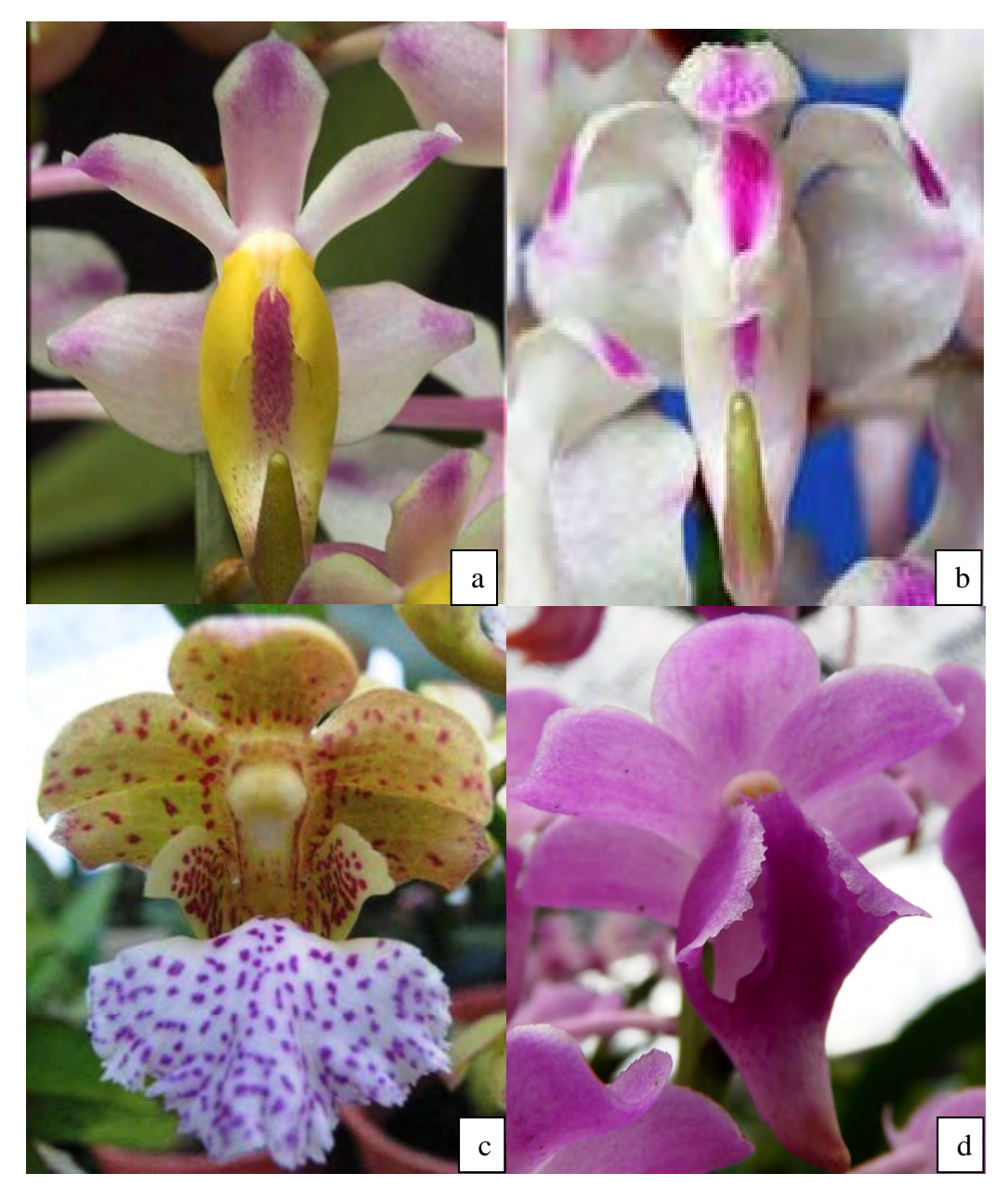
Figure 1. Flowers of (a) Aerides odorata var.'Yellow' (b) Aerides odorata (c) A. flabellata (d) A. quinquevulnera var. calayana.

Table 1. Successful and unsuccessful crosses between A. odorata , A. odorata var.'Yellow', A. quinquevulnera var. calayana , and A. flabellata .