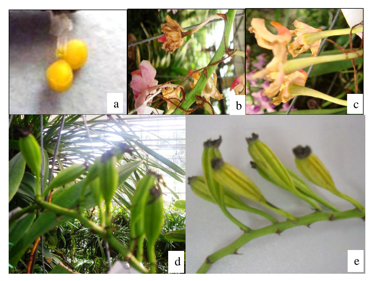
Figure 2. (a) Globular shaped pollen of A. odorata (20x); (b) Successful cross of A. quinquevulnera var. calayana ( \stackrel{\circ}{\downarrow} ) x A. odorata ( \stackrel{\circ}{\mathcal{S}} ); (c) Pod development one month after pollination; (d) Pod development four months after pollination; (e) Matured capsules containing hybridized seeds (6 months after crossing).