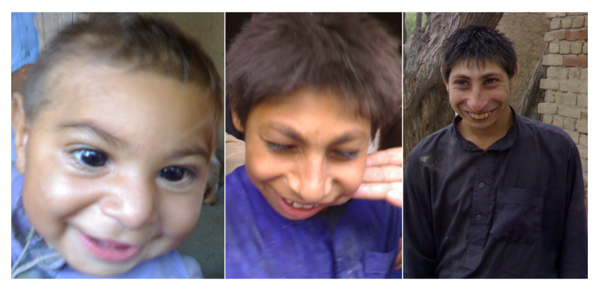
Figure 1. Photographs of few primary microcephaly patients of MCPH Pakistani families.

Table 1. A summary of clinical findings of affected members of MCPH families.