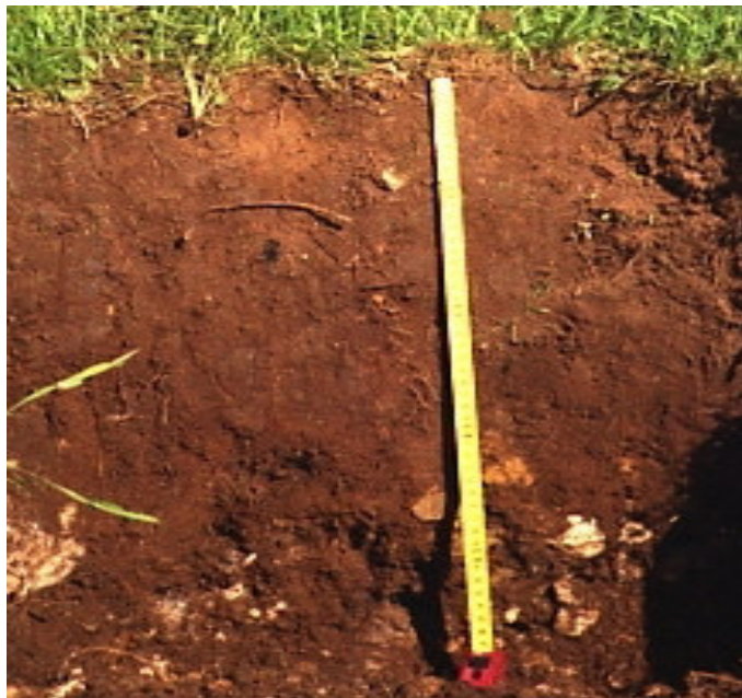
Figure 3. Typical soil profile of Rendzic Leptosol on morainic deposits.

Knežević, 2004). The amount of essential elements in the soil, if found to be low, is considered deficient, while a higher amount is considered toxic. For non-essential metals a gradation of deficiency is not referenced, and are only designated as either optimal or toxic (Adriano, 2001). Knowing the concentration of metals in a soil profile is valuable for many scientific disciplines, but it is most important to understand the relationship between the total concentration of metals and their biological effect (Herbert and Yin, 1998). The availability of heavy metals to plants, primarily depends on adsorption – desorption reactions between the solid phase and the soil solution (Leslie, 2002). The movement of heavy metals through the soil is directly caused by adsorption processes (Vogeler, 2001) and chemical speciation in the soil is important for their activity and is dependent on several factors including the initial concentration, the presence of other ions such as chloride and the degree of organic complexation (Lumsdon et al., 1995). Overall, the impact of aeropollution increases the concentration of metals in the soil, which results in a greater concentration of heavy metals that become available to plants (Påhlsson, 1989).