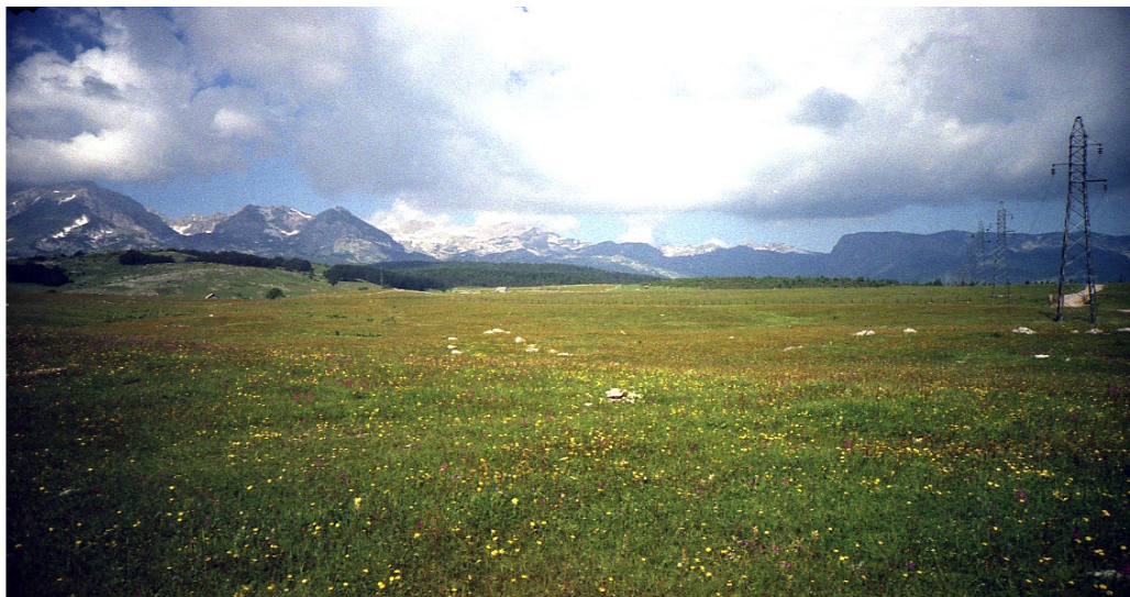
Figure 2. Grassland of the Lake Plateau at 1350 m.

activities (urbanization and exploitation of nature) have exerted a greater negative impact on the highly complex and important forests and grassland ecosystems than on water quality resources, soil resources and loss of biodiversity via the collection, use and trade of commercially important species. Overall, the mountain and sub mountain meadows and pastures have been significantly negatively impacted in the course of the 20th century.