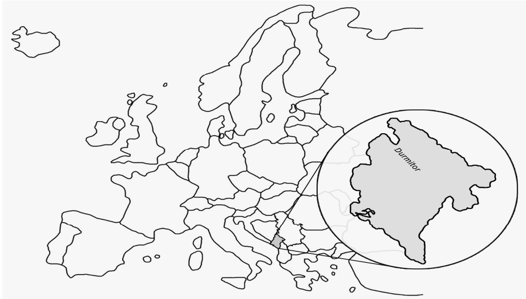
Figure 1. Study area of Mountain Durmitor in Montenegro.