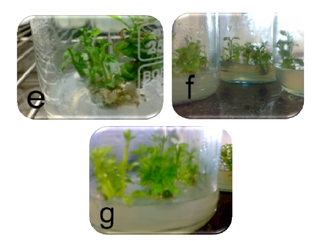
Figure 2. Different potential of shoot multiplication (No./explants) and shoot elongation in apple genotypes (e, 'M27'; f, 'MM106'; g, 'M9') were cultured on the basal MS medium contain BA 4.4 \mu M + TDZ 2.7 \mu M, + IBA 1.0 \mu M + NAA 1.22 \mu M and GA<sub>3</sub> \mu M for shoot elongation six months after culture.