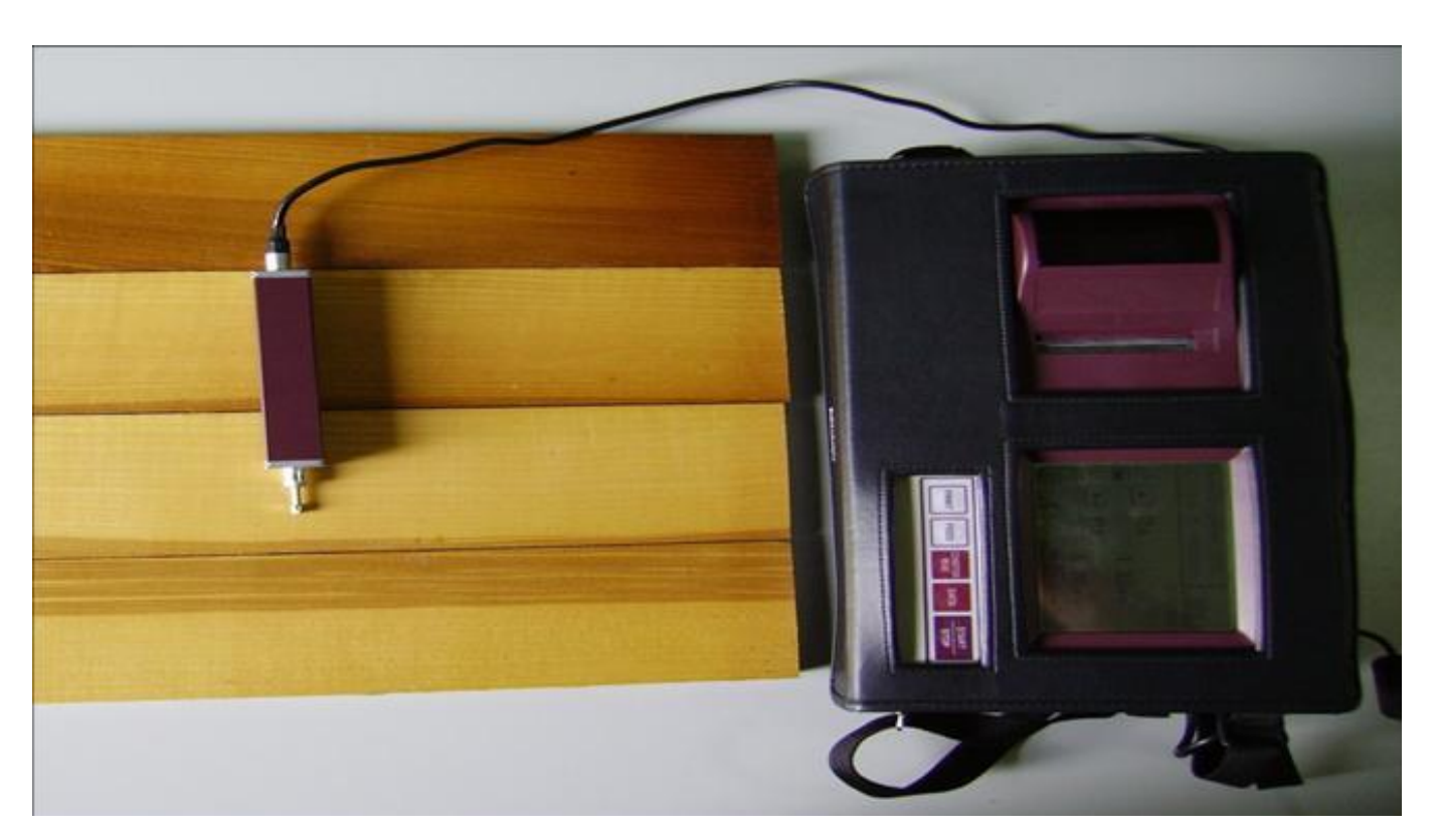
Figure 3. Mitutoyo Surftest SJ-301.