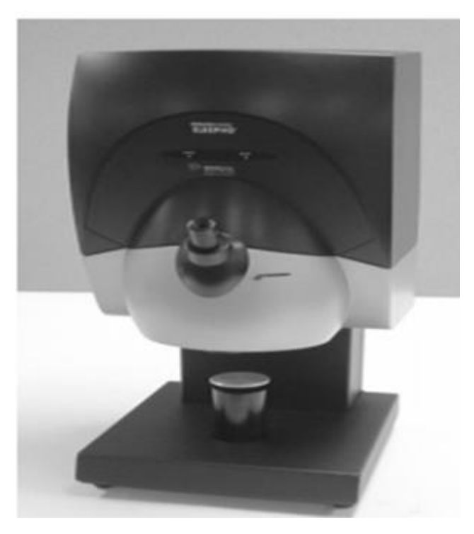
Figure 1. Elrepho-spectrophotometer.