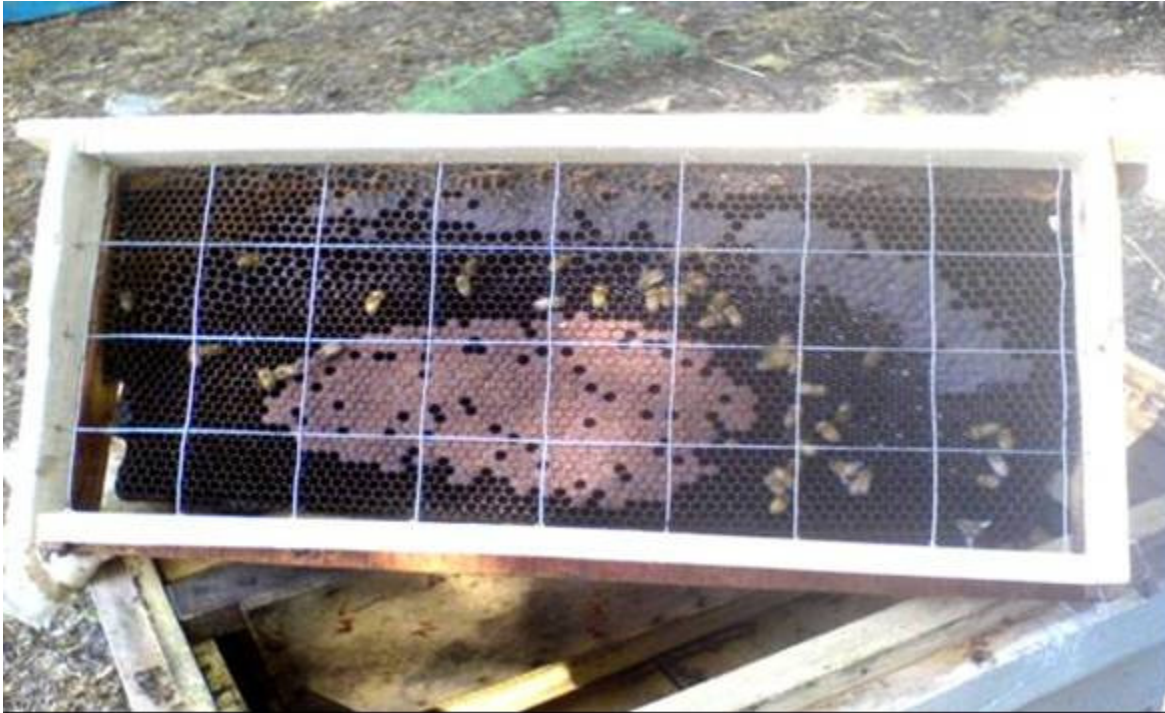
Figure 4. Measurement of brood population.