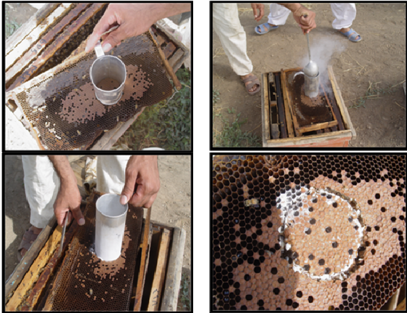
Figure 1. Hygienic behavior evaluation in the Iranian honey bee.