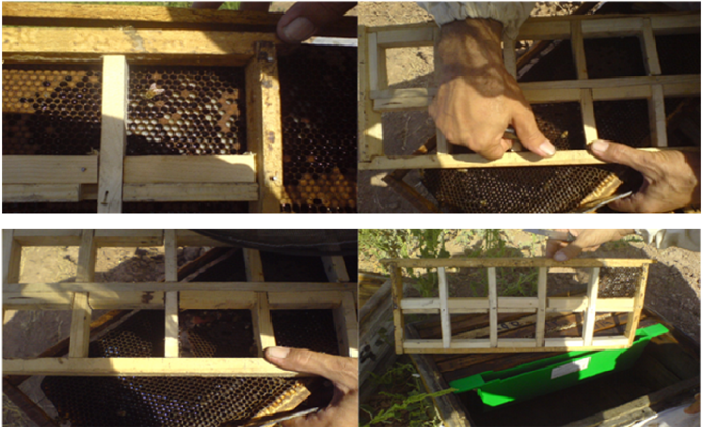
Figure 2. Selection 5th instar larva and transformation 7 \times 7 \text{ cm}^2 compartments to pre-equipped frames.

Some colonies were capable of removing frozen and killed brood completely (hygienic) but certain not non hygienic.