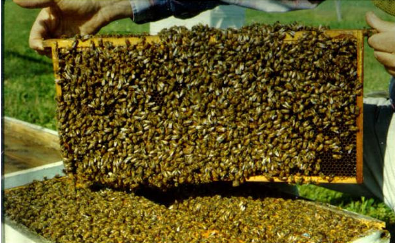
Figure 3. Measurement of adult bee population.