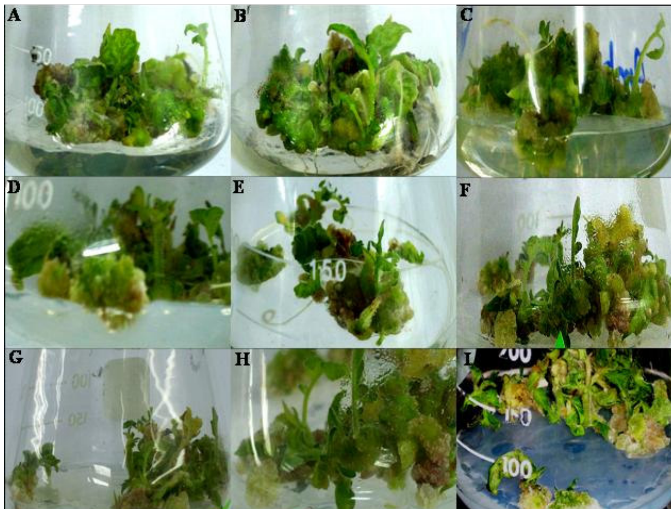
Figure 1. Shoot proliferation in different tomato varieties tested with CW. (A and B) Rio Grande callus proliferation with morphogenesis in to shoots of leaf discs on media containing coconut after 7 days of culturing, (C) callus with multiple shoots on RM 8 medium 10 days after culturing, (D) shoots multiplication from leaf disc derived callus after 12 days on RM 8 , (E) Roma hypocotyl derived shoot proliferation with multiple shoots on RM 7 , (F) leaf disc derived shoot proliferation with multiple shoots on RM 7 ; 12 days after culturing, (G) Avinash hypocotyl derived shoot proliferation with shoot on RM 7 ; 18 days after culturing, (H) multiple embryos coming out of leaf disc derived callus to form shoots and (I) callus with shoot proliferation on RM 8 in Avinash.