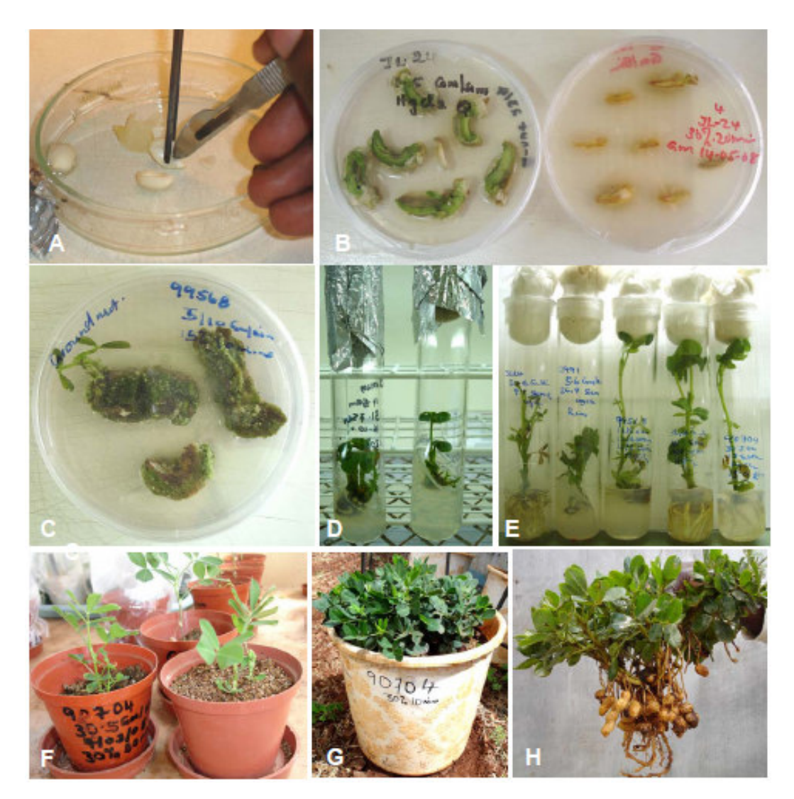
Figure 2. Regeneration of multiple shoots and plants from the cotyledon explants of groundnut. A ) Preparation of cotyledon explants for in vitro culture. Aseptic removal of the embryo from a surface sterilized, uncoated seed of ICGV 90704. B ) Comparison of NaOCI and HgCl<sub>2</sub> surface sterilization on the regeneration response in JL 24 after 14 days in culture. C ) Shoot bud formation at the proximal end of explants of ICGV-99568 within 28 days of cultivation on SIM. D ) Elongated shoots from two different varieties in SEM. E ) Rooted plants of all 5 varieties used in this study on RIM. F and G ) Acclimatized plants growing in the greenhouse and outside in soil. H ) Mature pods harvested 4 months after hardening. About 30 - 40 seeds were recovered from each plant.

plants. Hence, the protocol is genotype independent and any of the varieties tested in this study will be suitable for future transformation studies with African groundnuts.