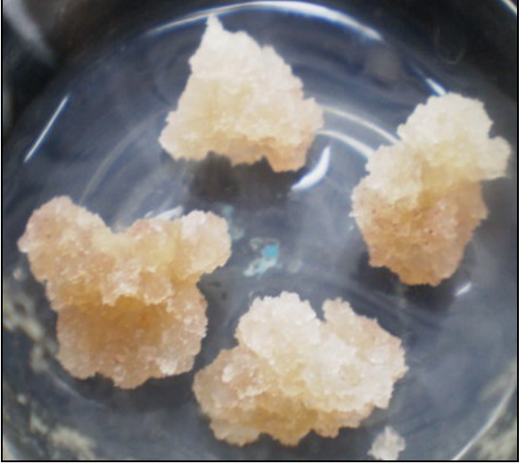
Figure 1 (a-b). A friable, pale and white C. odorata petal-derived callus on MS medium, B5 vitamins supplied with 3.0 mg/L NAA and 0.5 mg/L BAP at pH 5.7 at 25 \pm 2 °C, in completely dark condition. (a) 4 weeks (b) 8 weeks of culture.