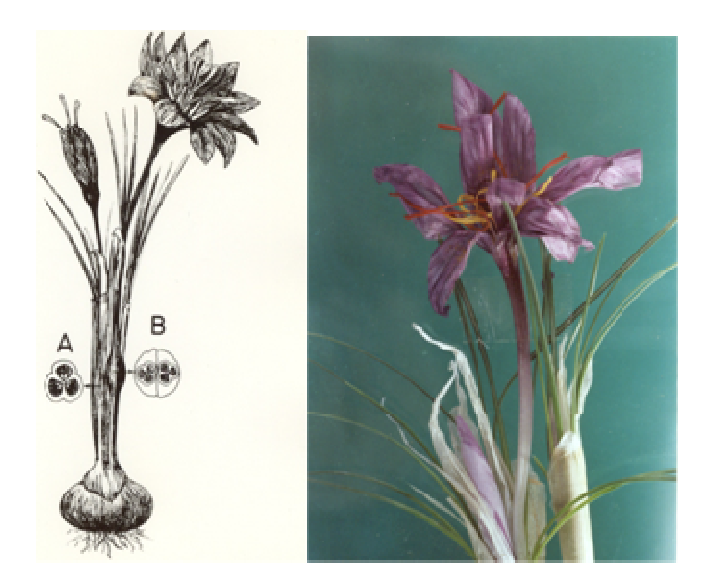
Figure 2. Normal (A) and rare (B) flower with six branches in stigma (ovaries are shown by arrows).

year, it was found that the abnormality had not been maintained and all flowers were normal. Moreover, both abnormal and normal flowers were seen on the same corm in rare cases (Figure 2). The above observations