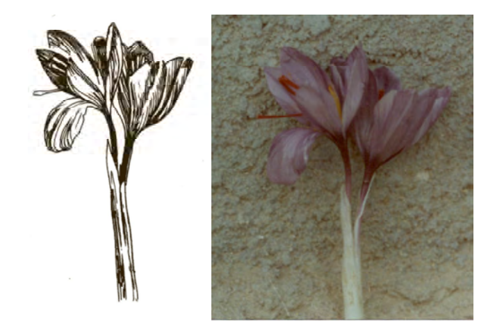
Figure 1. Two normal flowers in one spathe.

Table 2. Comparison of yield in normal and abnormal saffron flowers.