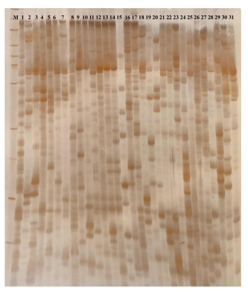
Figure 1. AFLP polyacrylamide gel profile of 31 wheat genotypes (14 species including wild, synthetic and cultivated species) using primer combination Pst I-ACG- Mse I-CGT. M is a lane of 50 bp molecular ladder and numbers correspond to the genotypic numbers listed in Table 1.