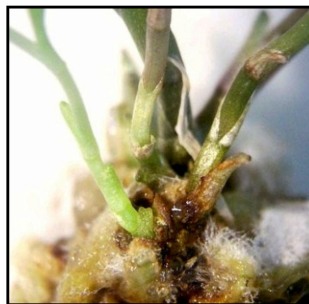
Figure 1. Shoots produced in M1 (MS + 1mg.l -1 BA + 0.2 mg.l -1 NAA) culture medium.

As shown in Table 1, the number of produced shoots (average 4.13) was affected the most by M1 culture medium (Figure 1). In the same concentration of BA (1 mg l -1 ) shoot proliferation increased in response to 0.2 mg l -1 NAA. Further increase of NAA (1 mg l -1 ) reduced shoot proliferation to 2.54. Replacing 0.2 mg l -1 NAA by 0.2 mg l -1 IAA had shown no significant effect for the above trait. Our finding showed (Table 1) that rhizome buds explants obtained from pot plants ( in vivo ) could results in higher number of shoot proliferation (3.97) compared with those derived in vitro (1.83). It should be mentioned that although using in vivo rhizome bud with larger size, more nutrition and hormone produced higher number of shoots but shoot regeneration of in vitro explants were more rapidly in less time duration. The main problem on using pot plant rhizome as initial explants was contamination which occurred frequently in cultures and it seems it is difficult to overcome. Analysis of variance showed (table not shown) no significant differences on combining effects of rhizome types and culture media.