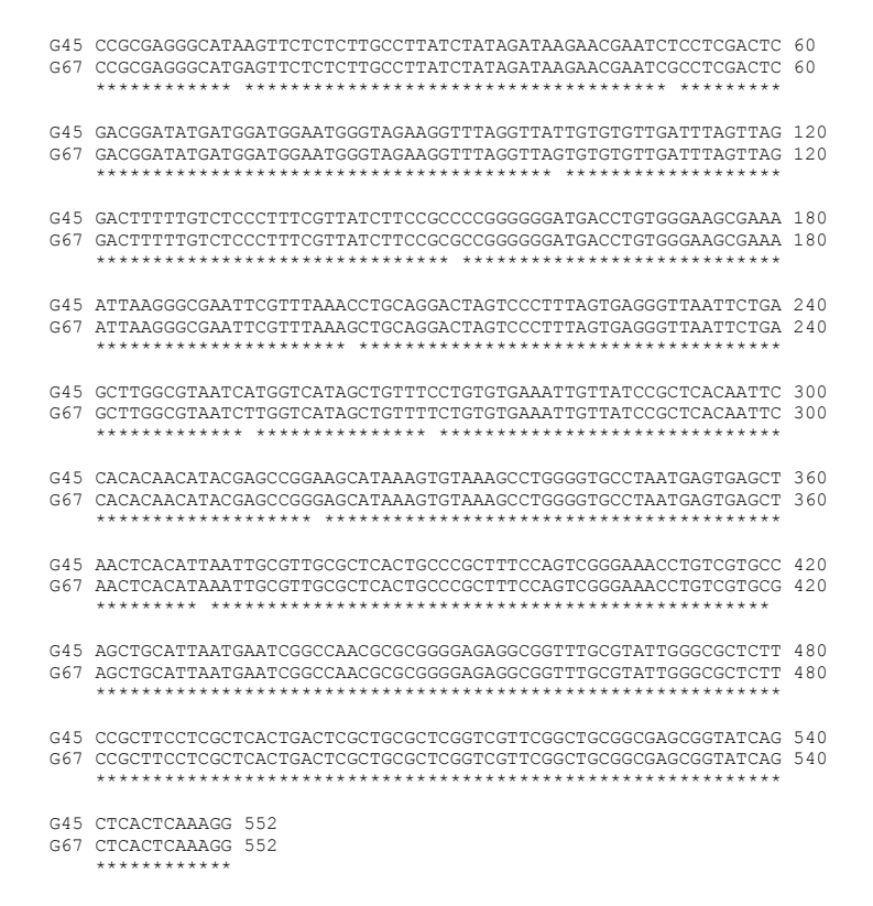
Figure 3. Comparative DNA sequence analysis of nonpolymorphic RAPD (N1) for G. barbandense G45 and G67 using CLUSTALW.

nonpolymorphic RAPD DNA fragment (N1) between two different G. barbadense cultivars, Giza 45 and 67, was determined and further investigated by DNA sequence alignment. These clones were designated G45 and G67 respectively. Comparative nucleotide sequence analysis of G45 and G67 using the ClustalW program revealed that these two DNA sequences are highly similar to each other, producing an alignment score of 98.5 (Figure 3). The high degree of similarity indicates that similarity of fragment size is a good predicator of homology, at least among closely related populations or species. It is noteworthy that aforementioned degree of homology reported in this study is higher than the previously reported study by Rieseberg (1996), who scored 91% homology of comigrating RAPD fragments in sun flower plants. The higher percentage of homology reported in our study could be due to two imperative reasons. First, the modified improved RAPD-PCR with the use of 20-mer random primer and higher annealing temperature, significantly increase RAPD reproducibility, and thus higher homology. Secondly, in our study, homology was investigated by DNA sequence analysis, while Rieseberg (1996) employed Southern blot and restriction analysis. It is known that DNA sequence analysis provides the most specific and sensitive method for detecting homology (Franca et al., 2002).