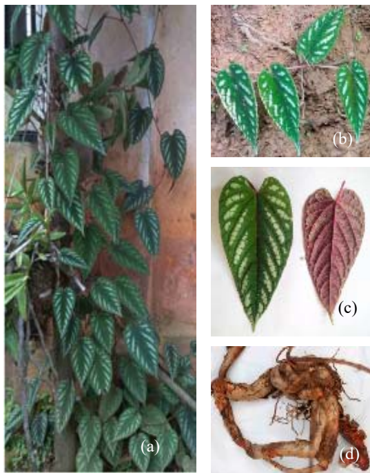
Figure 1: Cissus javana : (a) whole plant; (b) branch; (c) leaves; (d) tuberous roots

Cissus javana DC. has several synonyms, including Vitis discolor (Blume) Dalzell, Cissus discolor Blume, Cissus javana var. pubescens C. L. Li, and Cissus sicyoides Klein ex Steud. [11]. The plant is an herbaceous climber with distinct leaves (Figure 1). The upper surface contains white patches, whereas the lower surface is purple. Leaves are mostly ovate shaped with a heart-shaped base and an apiculate apex [12]. In Myanmar, the tuberous roots are used as a folk medicine for treating ovarian cancer [13], while in India, the leaves are known for anti-DM activity [14]. Prior to the present work, no studies on the anticancer or anti-DM constituents of C. javana roots have been described.