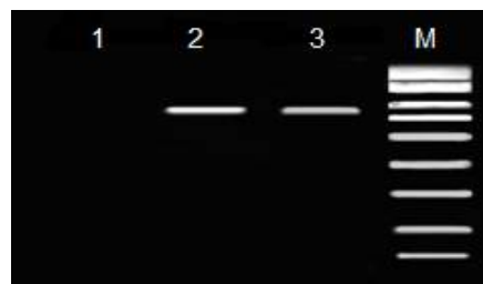
Figure 1: Agarose gel electrophoresis of PCR-amplified omp31 and eae gene products. Lane M: 100-bp DNA marker, lane 1: negative control, lane 2: amplified eae gene fragment, lane 3: amplified omp31 gene fragment

Omp31 gene fragment, which has a Bam HI/ Xho I restriction site, and the eae gene fragment, which has a Xho I/ Xba I restriction site, were inserted in the polyclonal site (PCS) of pCDNA3. The result of pCDNA3- omp31-eae restriction using Xho I/ Xba I enzymes is shown in Figure 4.