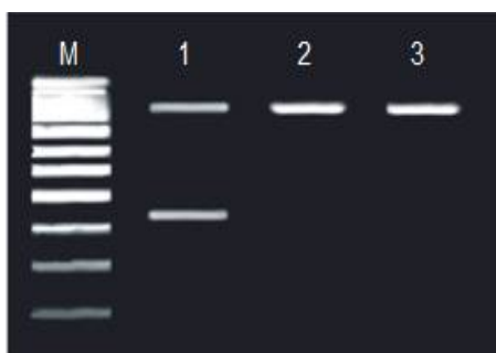
Figure 4: PcDNA3- omp31-eae restriction analysis. Lane M: 1-kb DNA marker, Lane 1: 5428-bp pcDNA3 fragment and 862-bp eae fragment (correct clone), Lanes 2–3: 5428-bp pcDNA3 fragment without the eae gene

antibodies were found in pcDNA3- omp31-eae immunized mice, but not those given pcDNA3. We determined the proliferation responses and cytokine profiles of spleen cells from mice injected with pcDNA3- omp31-eae , pcDNA3, and PBS to examine cell-mediated immunity (CMI). Lymphocytes from mice immunized with pcDNA3- omp31-eae had an apparent T cell proliferative response to rOmp31 and rEae proteins ( p < 0.01 ) with a stimulation index of 14.90.