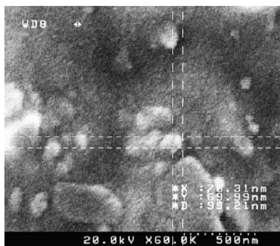
Figure 2: SEM image of nanoliposomal cisplatin