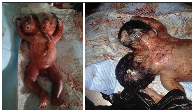
Figure 1: Bicephalus conjoined twins – anterior view. Bicephalus conjoined twins – posterior view

The parents did not consent for postmortem X-rays or autopsy.