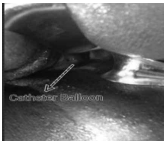
Figure 1: Picture showing the inflated urinary catheter balloon protruding through the defect on the anterior vaginal wall

Contrary to common findings that women with VVF are often ostracized by their husbands, families, and communities, [10] our patient had good family support. The presence of a living