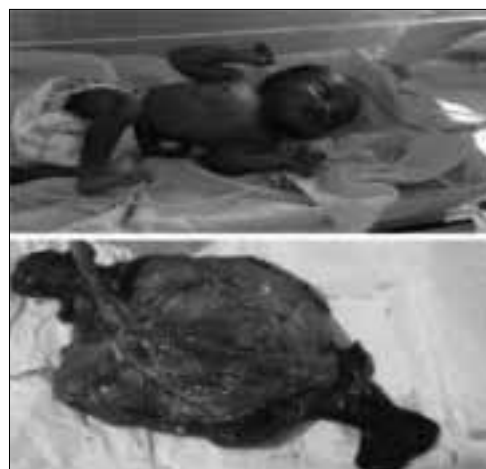
Figure 2: Picture showing the baby being nursed in incubator in Neonatal ward and the placenta below