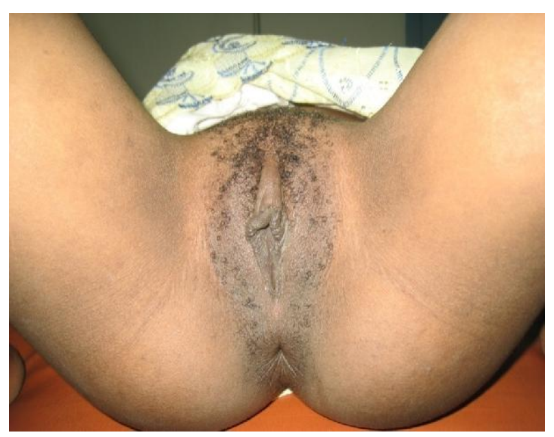
Figure 2: The appearance of the external genitalia on 4th day post operation

Post operatively the girl improved remarkably and was discharged home on 6<sup>th</sup> day. Because she was coming from far, she was instructed to go back to the referring district Hospital after 2 weeks for follow up. Report so obtained 4 months after the operation during supervision visits gave a success story that the patient attended their hospital and she was doing fine (Figure 2).