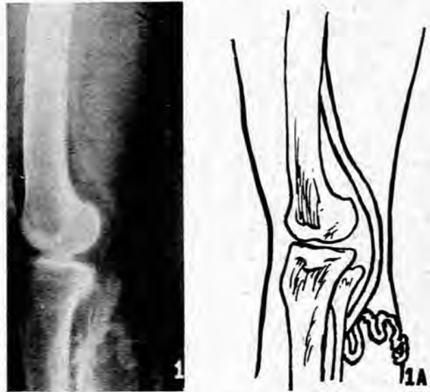
Fig. 1. Venogram of an incompetent small saphenous in a patient who had undergone stripping of both systems 18 months previously. When the popliteal area was re-explored the vein, lying deep in the muscle, was found only after a careful search which, but for the venogram, would have been abandoned—as it probably had been on the first occasion.

4. Neglect of the small saphenous. Although this vein is incompetent only 1/8th times as often as the great saphenous it is responsible for quite a number of so-called relapses—particularly where it shunts its flow to the inner side of the leg and tries to throw the blame on its big brother. As the terminal part of the small saphenous lies for a good deal of its course under a tough deep fascia, clinical examination is often difficult and incompetence may easily be overlooked (Fig. 1). Ligation of this vein, as with the great saphenous,