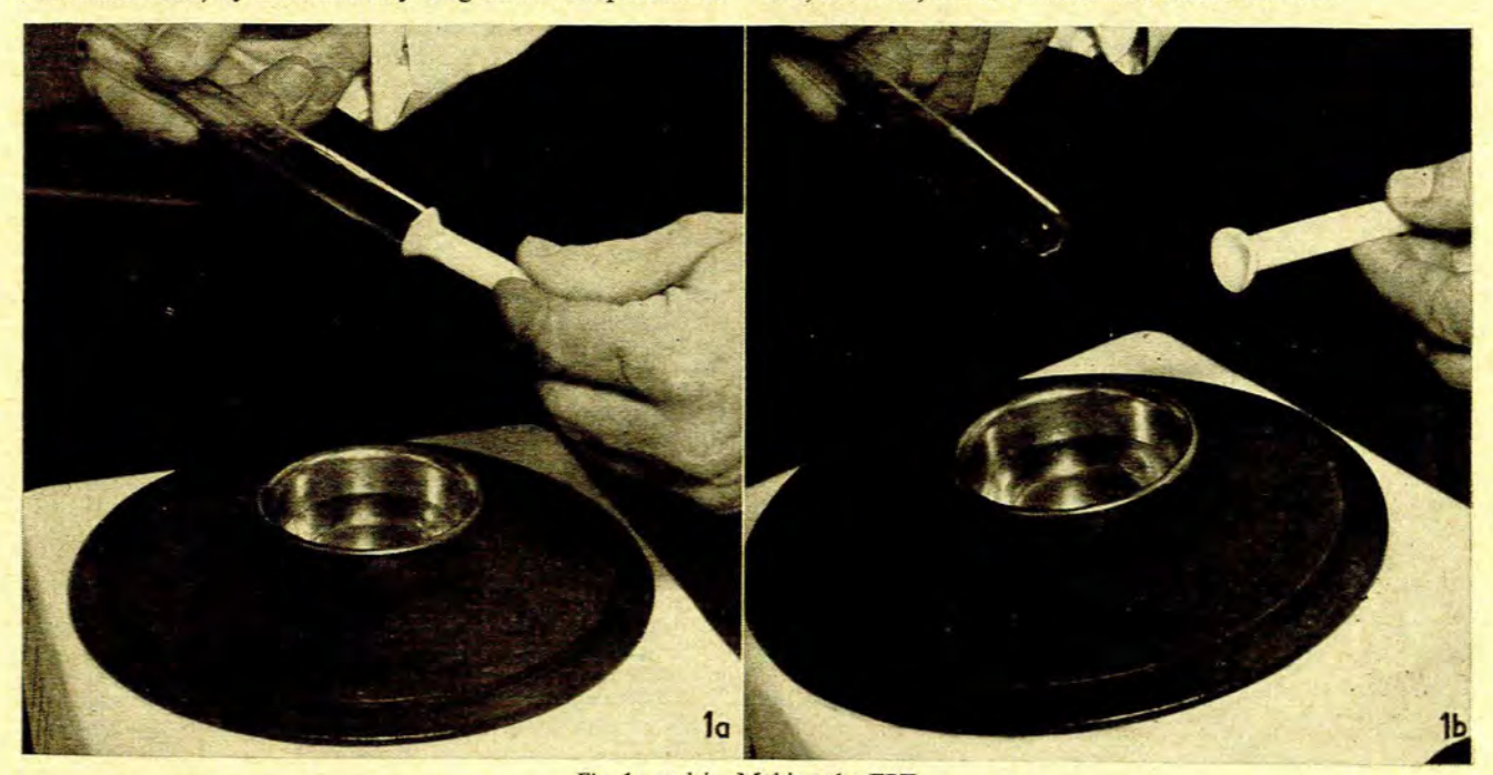
Fig. 1a and b. Making the FPT.

Attempts have been made in Scandinavia to maintain the lumen by permanent canalization with a rubber feeding tube introduced through a lateral pharyngotomy. This procedure was, however, not continued for obvious reasons.