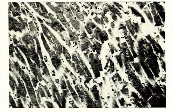
Fig. 3. Case E, who died of tetanus. Section of myocardium showing myofibrillar degeneration. Cytoplasmic banding is prominent (H. and E. \times 100).

Examination showed the facies of risus sardonicus, trismus and opisthotonos. His pulse was 94/minute, regular, and the blood pressure 150/90 mmHg. Tetanic spasms were noted. A tracheostomy was performed and he was treated with intermittent positive pressure respiration, skeletal muscle relaxants, sedatives, tetanus antitoxin and antibiotics. Signs of autonomic nervous system overactivity developed with a labile pulse rate and blood pressure. Phenoxybenzamine was given in an attempt to counteract the sympathetic nervous system overactivity.