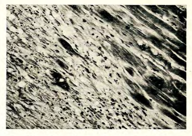
Fig. 2. Case 2. Area of advanced myocytolysis showing a few individual surviving myofibres, collapsed supporting stroma and scanty lymphocytes (H. and E. \times 100).

Histology of the myocardium revealed multiple areas of myocytolysis corresponding to the macroscopical lesions. Some lesions appeared recent, whereas in others the myocytolysis was more advanced, and the supporting stroma alone was left and was beginning to collapse. Scanty histiocytes and plasma cells, but no polymorphs, were present (Fig. 2).