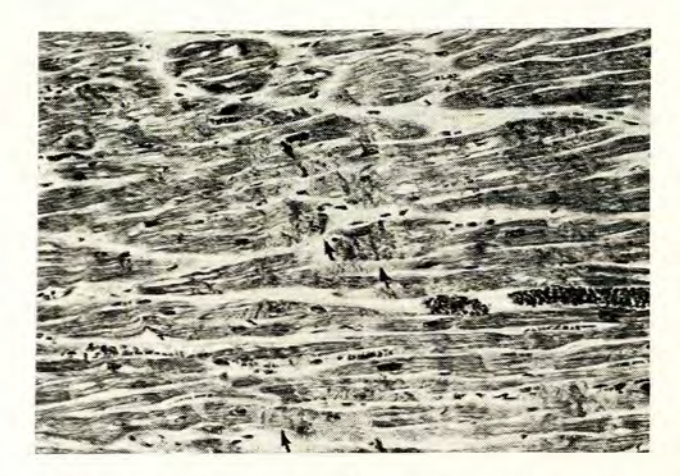
Fig. 1. Area of myofibrillar degeneration in left ventricle of case 1. The myocardial cells show segmentation and banding of cytoplasm (arrows). No polymorphs are present (H. and E. \times 100).

LV = left ventricle; VMA = vanillylmandelic acid.