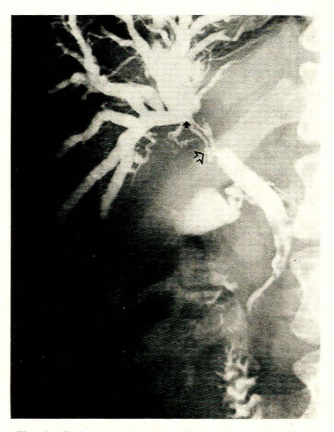
Fig. 3. Cholangiocarcinoma main hepatic ducts (black arrow) with moderate intrahepatic biliary dilatation with incomplete obstruction and filling of the distal common bile duct and gall bladder. The lymphatics draining to glands in the porta hepatis have filled from interstitial injection (white arrow).

The cause of jaundice in the 7 remaining true negative cases with non-surgical jaundice is shown in Table II.