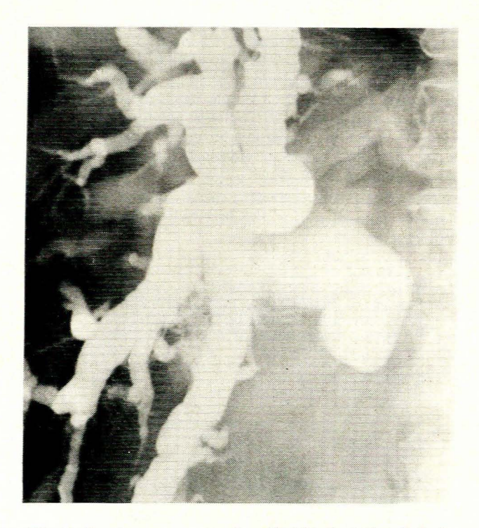
Fig. 2. Carcinoma common hepatic bile duct (low lesion) with gross intra- and extrahepatic biliary dilatation. The lesion is proximal to the cystic duct origin but the site of obstruction has a similar appearance to that in Fig. 1.

Of the 39 cases with surgically correctable jaundice, the dilated biliary tree was successfully punctured in 34 (85%). Of the remaining 5 cases, 3 were true failed punctures while the remaining 2 had small-calibre ducts due to cholangitis with associated calculi. These 2 cases were therefore regarded as false negatives.