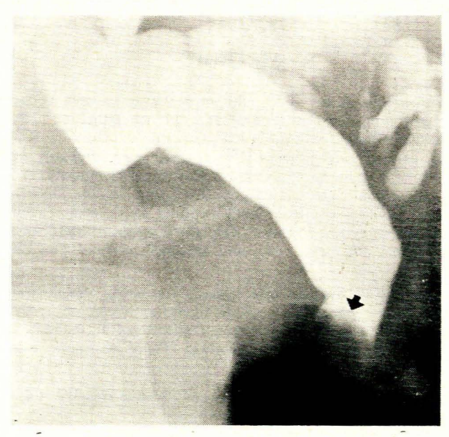
Fig. 4. Common bile duct calculus with a convexity at the site of obstruction (arrow).