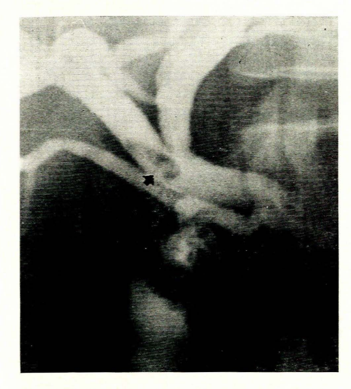
Fig. 5. Cholecystenterostomy with a stone in the right hepatic duct (black arrow) causing recurrent cholangitis. There is drainage into the gall bladder (white arrow).