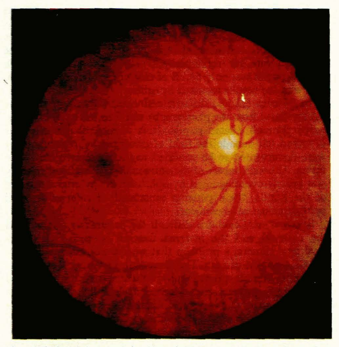
Fig. 2. Colour photograph of the right fundus obtained through a dilated pupil showing background retinopathy and laser spots.

The somewhat more heavily pigmented retinas of black patients posed no problems and it was possible to obtain photographs