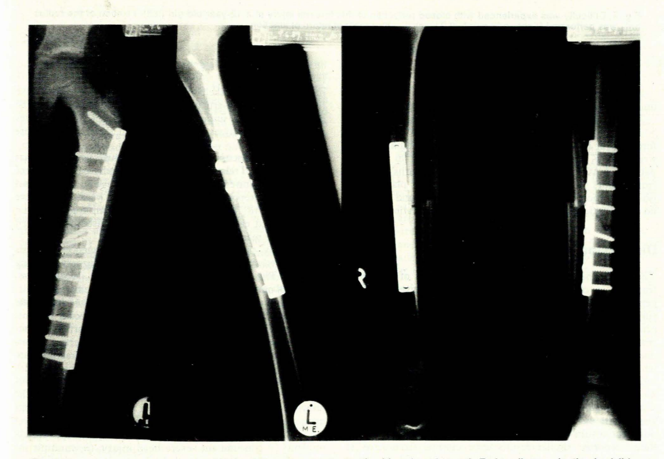
Fig. 2. Radiographs of injuries of contralateral limbs in a polytraumatised boy (age 6 years). Early callus production is visible. Early mobilisation was achieved.

Limb lengths measured clinically were equal at follow-up in 27 patients within the first year of follow-up. However, in 6 children under 12 years of age returning after 1 year for removal of metal after plating of the femur limb overgrowth was consistently seen, and measured 1 - 1,5 cm in every case.