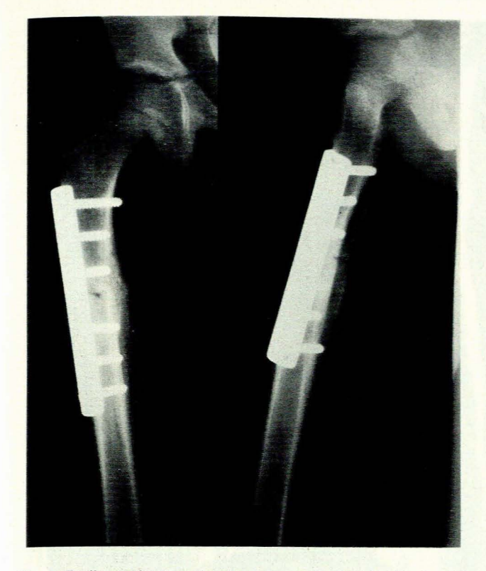
Fig. 1. Radiographs 6 weeks after internal fixation of a fracture of the right upper femur in a 6-year-old girl with a head injury. A good position has been maintained and union is advanced.

In general, intramedullary rods/nails were used only in patients nearing skeletal maturity, and external fixation devices in cases of severe soft-tissue injury, with or without vascular damage. Three late internal fixations were performed, 2 for delayed union and 1 for mal-union.