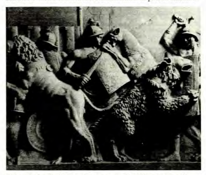
Being able to afford a ring-side seat to watch gladiators and wild animals fight to the death in a sandy arena may have put Roman noblemen at particular risk of contracting the disfiguring disease mentagra — possibly a variety of leishmaniasis transmitted by sandflies.

The late Empire's first major epidemic (that of Cyprian) lasted 15 years (251 - 266) and devastated the whole 'known world' after originating in Africa. It spread by direct contact and showed a seasonal incidence with maximal impact in autumn