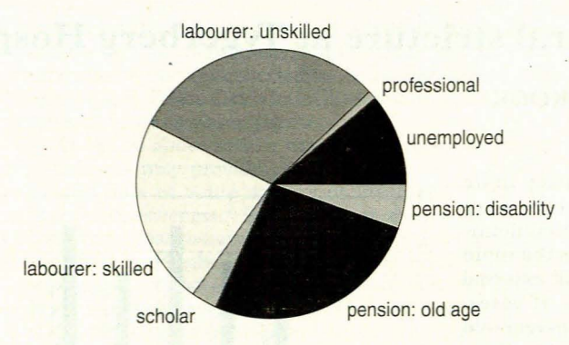
FIG. 3. Occupations of patients with urethral stricture.

Thirty-four patients did not use tobacco, alcohol and drugs. However, 64 smoked, 62 drank alcohol and 12 were drug abusers. There was no association between religious beliefs and stricture formation.