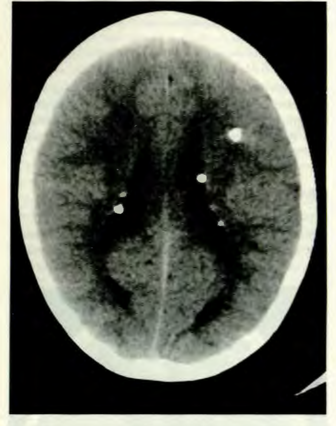
Fig. 3. Tuberous sclerosis: bilateral, round densely calcified nodules in the subependymal area of the lateral ventricles and a single parenchymal calcification which probably represents a calcified white matter lesion.

also show atrophy, ventricular enlargement and neuronal migration anomalies.<sup>12</sup>