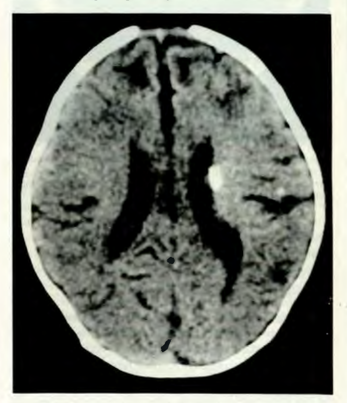
Fig. 2. CMV: a periventricular calcification in relation to the left lateral ventricle and another smaller calcification in the left parietal parenchyma.

CMV has a particular affinity for the developing germinal matrix. This causes widespread periventricular tissue necrosis with subsequent dystrophic calcification. CMV can, however, also cause widespread parenchymal calcification. NECT will