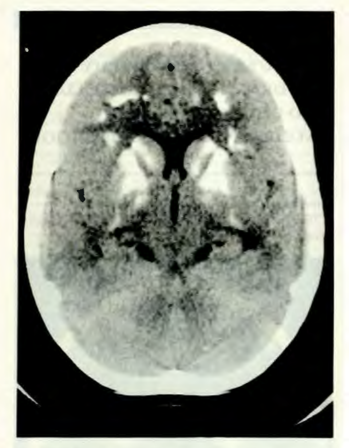
Fig. 4. Pseudohypoparathyroidism: coarse, bilateral, symmetrical basal ganglia, periventricular and parenchymal calcification.

In this condition there is a lack of response of the end-organs to parathormone (PTH) which results in low serum calcium and high serum phosphate levels. On NECT calcification can be seen in the basal ganglia. These calcifications are bilateral and