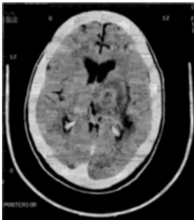
Fig. 1a. Pre-treatment contrast-enhanced CT scan showing a hypodense lesion in the left basal ganglia with rim enhancement and surrounding oedema, causing effacement of the third ventricle and midline shift.

This study establishes the efficacy of oral co-trimoxazole as therapy for acute cerebral toxoplasmosis in the doses described. This has significant utility in the public sector. It is recommended that oral co-trimoxazole be implemented as first-line therapy in cases of suspected cerebral toxoplasmosis.