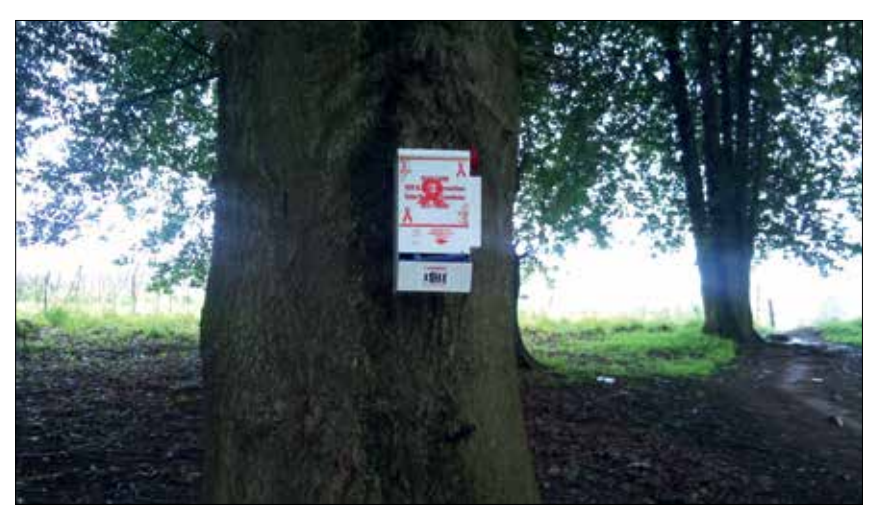
Fig. 1. A S'Khokho bushcan.

The bushcan initiative highlighted the fact that condoms are not as easily accessible to all South Africans as is often thought. By