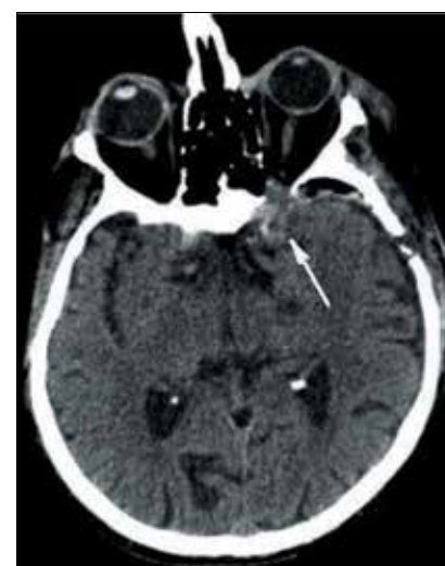
Fig. 1. Cranial CT showing a tumorous mass in the left orbital apex (white arrow).

Aspergillomas of the orbit were reported more often in the 1960s and 1970s and less in the 1980s and 1990s. There was an increase