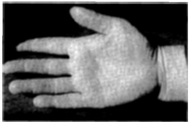
Fig. 2. Palmar crease xanthoma. Yellow infiltration of the palmar creases is diagnostic of dysbetalipoproteinaemia.

Dysbetalipoproteinaemia can be diagnosed on clinical grounds if the characteristic palmar crease xanthomas (yellow discolouration of palmar creases) are seen in the presence of a mixed hyperlipidaemia (Fig. 2). Patients may also have tuberous, tubero-eruptive and tendon xanthomas, but these lesions are not unique to dysbetalipoproteinaemia and are frequently absent (Fig. 3). Laboratory confirmation requires specialised testing, but there are no universally accepted diagnostic criteria. Testing is based either on analysis of apoE, usually by genotyping, or on analysis of lipoproteins for their composition or electrophoretic properties. Only 42% of patients have the characteristic broad-beta band on agarose gel electrophoresis, 15 which is the most widely available test. Electrophoresis of ultracentrifugally isolated lipoprotein fractions and the demonstration of abnormally migrating VLDL ( \beta -VLDL) is diagnostically more useful. The presence of \beta -migrating lipoproteins in the VLDL fraction (VLDL