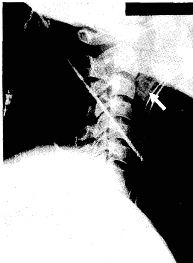
Fig. 2. Lateral cervical spine radiograph showing prevertebral soft-tissue oedema that required airway management with an endotracheal tube. Note the bullet in the ramus region and the fractured condyle.

skeleton (region of the mandible) and an exit wound was present in more than half the cases (i.e. perforating injuries) that infrequently involved the neck. The airway was threatened in 20 cases (22%) at admission with only 1 patient having arrived with an endotracheal tube already inserted by paramedics. At admission 12/20 cases (60%) were treated with oro- or nasotracheal intubation (Fig. 2); 9 of these later had elective tracheostomies. Eight of the 20 patients (40%) needed immediate surgical airways — five tracheostomies and 3 cricothyroidotomies. All the cricothyroidotomies were later converted to tracheostomies. Of the 37 airways recorded as normal on admission, three later required emergency tracheostomy.