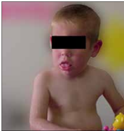
Fig. 3. Proband S. A coarse facies, grooved tongue and macroglossia were present.

Proband S had broad, short fingers with bilateral fifth-finger clinodactyly. His toes were broad and he had pes planus. He had mild lumbar lordosis. He had a patent ductus arteriosus with a patent foramen ovale that closed spontaneously. There were no genitourinary abnormalities. Abdominal examination showed hepatomegaly of 2 cm below the costal margin, which had been stable for several years. He was hypotonic and had a developmental quotient of 60, in keeping with mild intellectual disability.