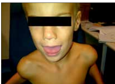
Fig. 1. The facial features of proband B, showing a broad nasal bridge, an upturned nose and a large, grooved tongue.

Sequencing for both probands and their respective mothers was performed using primers employed for the PCR, with