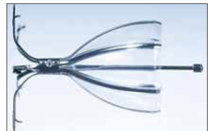
Fig. 2. An intrabronchial (IBV) valve.

There are currently two commercially available devices available in SA: Zephyr endobronchial valves (Pulmonx Inc., USA, Fig. 1) and IBV intrabronchial valves (Olympus Respiratory America, USA, Fig. 2). Both devices are self-expanding and delivered using a catheter that is introduced through the working channel of a flexible bronchoscope. [2] The most common reported adverse events experienced with endobronchial valve placement have been pneumothoraces (2 - 10%), mild haemoptysis (2 - 6%) and exacerbations of underlying chronic obstructive pulmonary disease (COPD) (8 - 40%). [4-7]