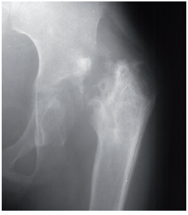
Fig. 3. Radiograph showing complete avascular necrosis of the left hip (10 months after hip sepsis). This child underwent surgery 3 weeks after the reported onset of symptoms to relocate and drain a septic dislocation.