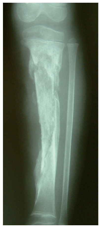
Fig. 1. Radiograph showing a large sequestrum in a child's tibia.

presence of piped tap water within the dwelling. The presence of tap water in the dwelling was found to be a useful discriminator of rural South African deprivation,<sup>10</sup> and this was combined with the data on employment and fiscal dependency to categorise those relatively 'deprived' and 'nondeprived'. Those in our study deemed 'deprived' did not have tap water in the dwelling and had a ratio of employed persons to fiscal dependants of less than 1:7. Data on distance to the local primary health care facility and maternal educational attainment (highest standard achieved at school) were also collected. Bacteriological and radiological data were recorded as well as intraoperative findings.