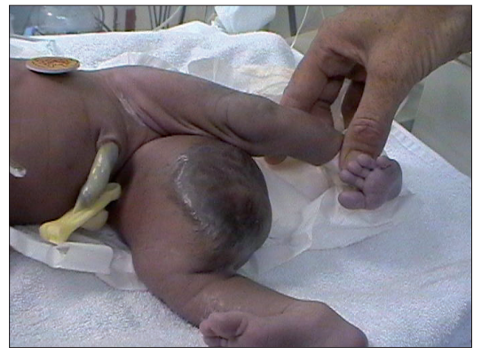
Fig. 2. Day 3 postnatal image of the swollen fetal right thigh.

report on congenital fibrosarcoma of the fetal thigh.<sup>5</sup> Tumours have been described according to their location on the body, e.g. head and neck, face, abdomen and retroperitoneum, skin, genitalia, sacrococcygeal region as well as tumours of the extremities.<sup>6</sup> Differential diagnosis for tumours of the extremities includes: ( i ) vascular haematosis; ( ii ) haemangioma; ( iii ) lymphangioma; or ( iv ) sarcomas.<sup>7</sup>