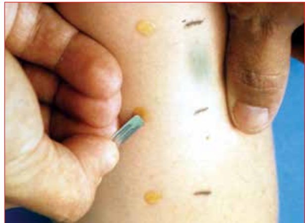
Figure 2: SPT on the forearm

Muscle relaxants and opioids may result in false positive reactions. Therefore, it is important to obtain a complete drug history in the history taking. Falsely diagnosing a patient with allergies can have a major negative impact on the patient and his or her family.