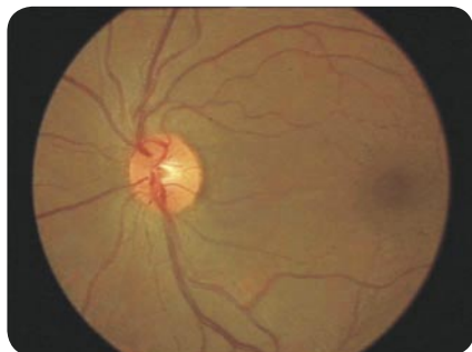
Figure 1: Progressive optic disc cupping

Normal disc with healthy rim. Cup : disc ratio of approximately 0.2