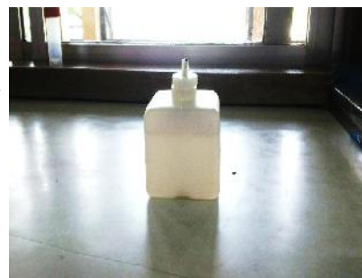
Fig 1: Container with sulphuric acid

A diagnosis of accidental corrosive ingestion with complications of upper gastrointestinal (GI) bleeding and chemical pneumonitis was made. She was commenced on supportive therapy including: Nil per oral, oxygen therapy at 1.5L/ min via nasal catheter, intravenous fluids, parenteral antibiotics (crystalline penicillin, metronidazole and gentamicin), steroids (hydrocortisone for 48 hours), intravenous ranitidine and a nasogastric tube (NGT) was passed. Chest x-ray (Fig 2) done at admission showed diffuse patchy opacity while her serum urea and electrolyte were normal. Within 24 hours of admission, she developed massive upper GI bleeding with abdominal distension, severe pallor, cold extremities, thready peripheral pulses and unrecordable BP, and NGT was draining fresh blood. She was resuscitated with normal saline and received multiple blood transfusions in aliquots on account of the bleeding which lasted for about 72 hours. On the 3 rd day of life, she developed fever, worsened abdominal distension, tenderness and guarding, with hypoactive bowels.