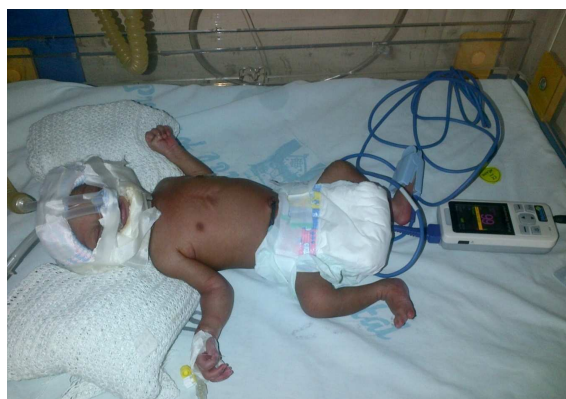
Fig 1: Neonate under Bubble Nasal CPAP

With the commencement of bubble nasal CPAP he progressively stabilized. Respiratory rate declined from 86 to 54 cycles/ min over 36 hours, his Downes' score improved to < 3, oxygen saturation rose from 70% to 98% almost immediately while heart rate and temperature remained within normal limits (Fig 2). Warmth was provided from a radiant warmer before he was transferred to an incubator.