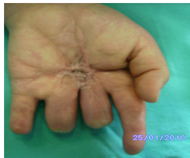
Fig 3: Amputated fingers after fireworks injury.