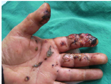
Fig 2: Avulsion after fireworks injury.

Firecrackers and rockets are the devices that are mostly used and cause most of the injuries. Our findings included the potential dangers of other devices like Roman candles. These findings are consistent with those of other authors. 5,7,9,10 The fingers, palms of the hands, face, head and neck were the most commonly affected sites. These sites of injury as well as the range of injuries found in our review are similar to previous reports. 4,7,9,10 The findings are understandable considering that the lighting of the devices requires use of the hands and in addition, the twinkling effects may have aroused the curiosity of the victims and encouraged them to hold the devices close to their faces.