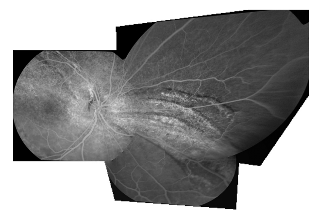
Figure 2: Fundus fluorescein angiography (FFA) right eye (RE)