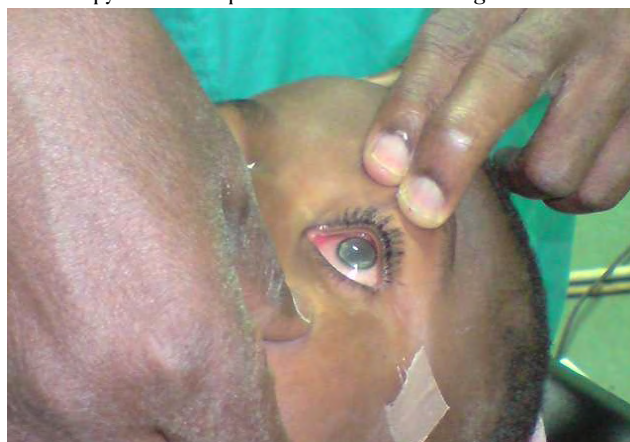
Figure 1. Cestode cysticercus in anterior chamber of eye of 7 year old girl.

The anterior chamber and ocular contents however appeared normal. Histology of the removed mass revealed a tiny fragment of grayish white tissue whose section showed a cestode larva having a cuticle with an invaginated protoscolex and integument (figures 2-4.) These features were suggestive of eucestoda infestation with propagation of the cysticercus in the eye. Stool examination for microscopy of ova and parasite were however negative.