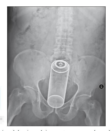
Figure 1: An abdominopelvic roentgenogram showed a bottle of deodorant

anal route in the clinic without anesthesia, but we failed in all patients because of the shape and location of the objects and limited dilatation capacity of the anus. AFBs in three patients were removed transanally by anal dilatation under general anesthesia. In eight patients, we needed laparotomy for the treatment. The objects removed from the patients were one body spray can, two bottles, three dildos, two sticks, one water hose, one corncop, and one pointed squash.