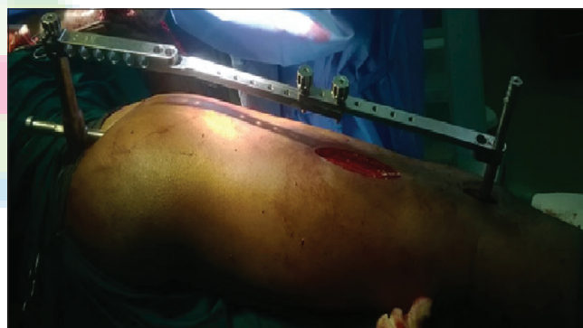
Figure 1: Antegrade approach: External jig attached to the inserted nail in antegrade approach

The union rate of femoral shaft fractures in this study was 95.3%. The mean time to radiological union was 14.0 \pm 1.2 weeks, with a range of 11–16 weeks. The mean time to painless full weight bearing was 14.2 \pm 1.2 weeks, with a range of 11–16 weeks.