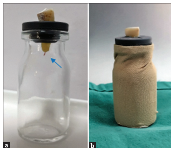
Figure 1: Representative images from test apparatus. Arrow points overextended gutta-percha. (a) Glass vial containing overfilled teeth. (b) Glass vial covering with opaque plaster

Figure 2 displays the number and percentage of successful removal of overextended gutta-percha from