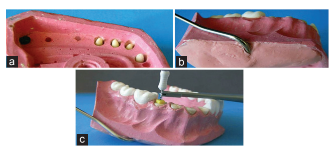
Figure 1: (a) Teeth were inserted into their sockets on the model. (b) Lip clip was inserted into unset alginate. (c) Figure of the test system

The distance between the tip of the file and the major foramen was measured using image analysis software program (Image J 1.42q, National Institutes of Health, Berklend, Maryland, USA). Positive values indicated that the file tip was beyond the major foramen [Figure 2a], negative values indicated that the file tip was short of the major foramen, and zero values indicated that the file tip was aligned at the major foramen [Figure 2b]. All measurements